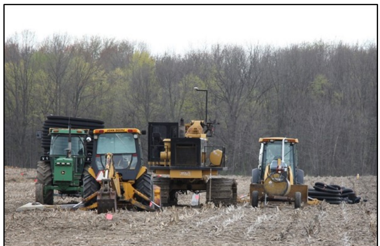
Installation of tile drainage on a farm field adjacent to a woodland.